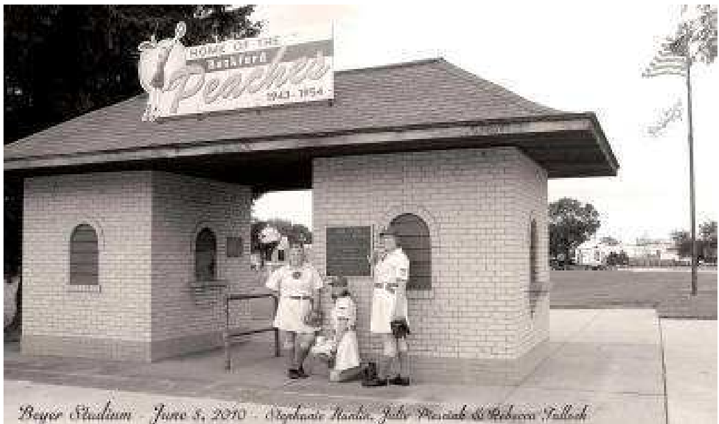
League Member in front of original Beyer Stadium Ticket Gate House at Rededication Ceremony in June 2010.

We play exactly how the original players played in 1943; with a 12" softball and underhand pitching, which is different than what was depicted in the film. We are mostly about teaching baseball women's history through playing ball and having a lot of fun doing it; experience playing baseball is not necessary, but always helpful. We are building the original 4 teams representing the Rockford Peaches, Kenosha Comets, Racine Belles, and South Bend Blue Sox; so if you live in Northern Indiana, North East Illinois, or South East Wisconsin and would like to play some 12" Softball with us, please send me an email with you interest. To learn more about our league and send us an email, visit our website at: www.ww2girlsbaseball.com .