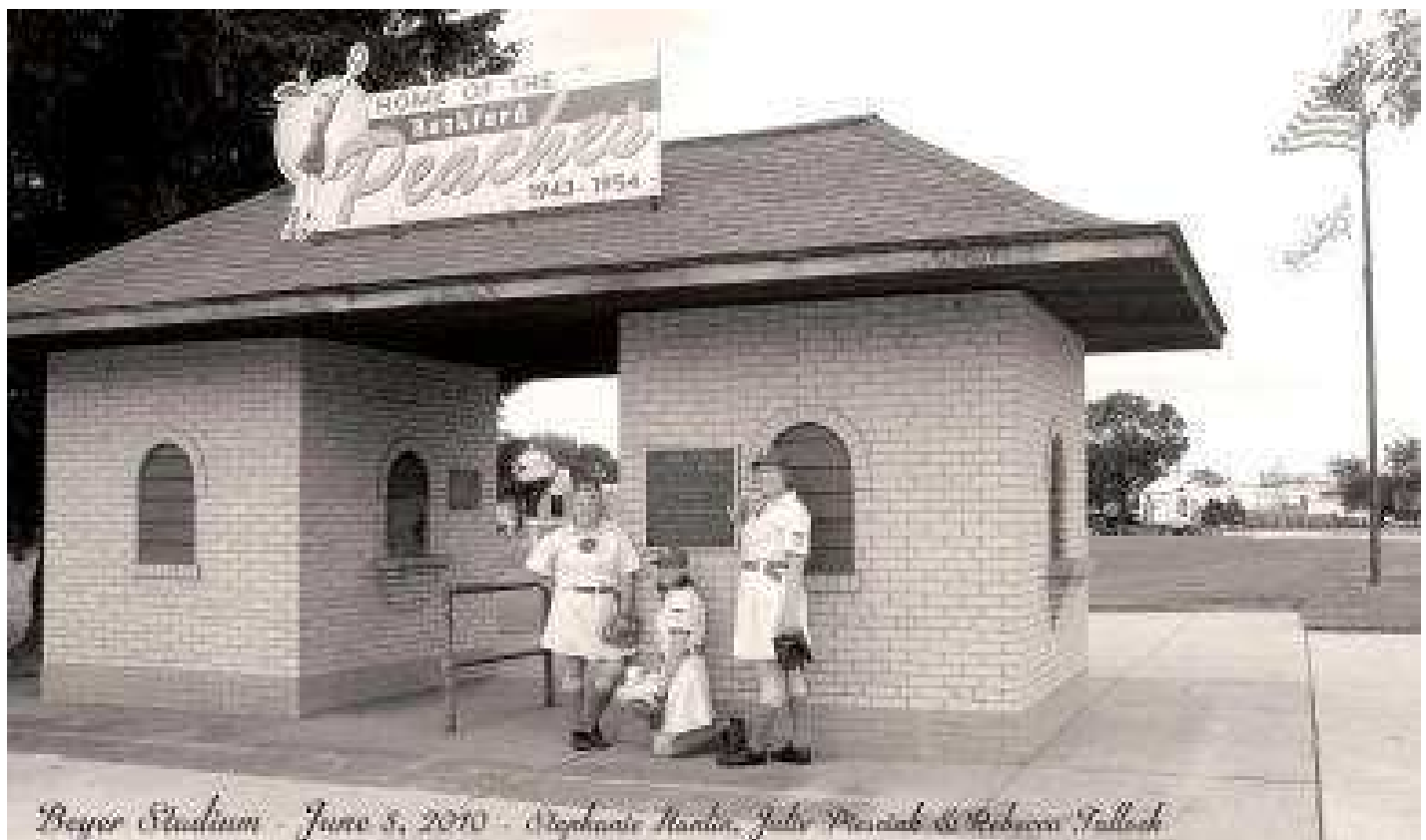
League Member in front of original Beyer Stadium Ticket Gate House at Rededication Ceremony in June 2010.

We play exactly how the original players played in 1943; with a 12" softball and underhand pitching, which is different than what was depicted in the film. We are mostly about teaching baseball women's history through playing ball and having a lot of fun doing it; experience playing baseball is not necessary, but always helpful. We are building the original 4 teams representing the Rockford Peaches, Kenosha Comets, Racine Belles, and South Bend Blue Sox; so if you live in Northern Indiana, North East Illinois, or South East Wisconsin and would like to play some 12" Softball with us, please send me an email with you interest. To learn more about our league and send us an email, visit our website at: www.ww2girlsbaseball.com .